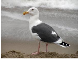
Greater Black Back