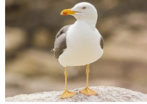
Lesser Black Back