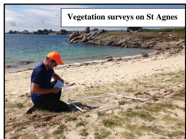
Vegetation surveys on St Agnes