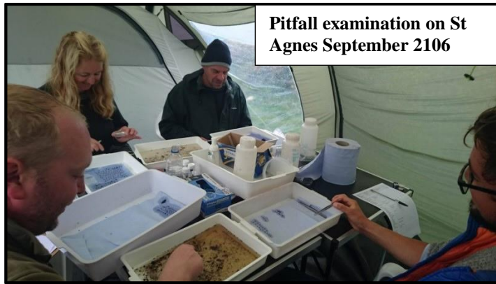
Pitfall examination on St Agnes September 2106

numbers of key species and species groups here can be compared to trends on Gugh and St Agnes where rats have been removed. If trends are similar on Gugh and St Agnes, but different on Bryher, then it is possible that rat removal is one of the causes of the difference. If the trends are the same across all three islands, or if trends are different between St Agnes and Gugh, then it is more likely that trends are independent of rat removal.