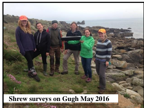
Shrew surveys on Gugh May 2016