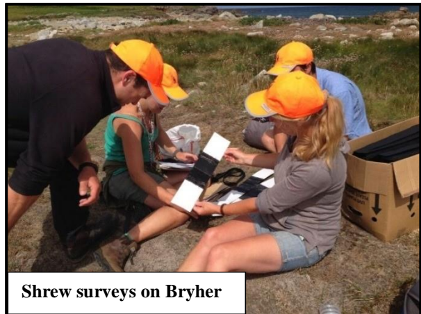
Shrew surveys on Bryher