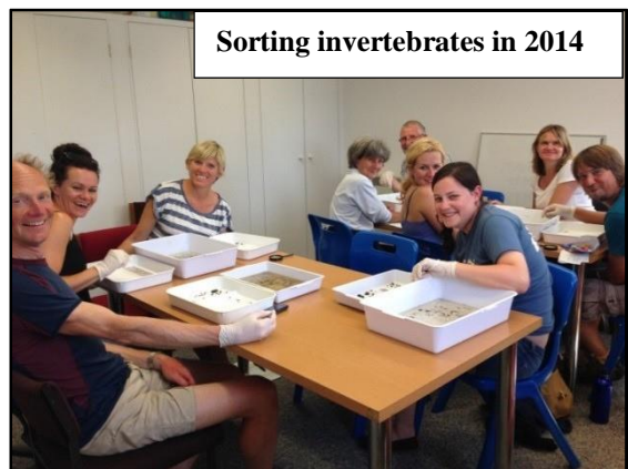
Sorting invertebrates in 2014

The project is based on surveys associated with four habitat types: European gorse scrub, maritime/coastal grassland, heathland and foreshore. The complete tranche of surveys were carried out on all three islands with the exception of rabbit surveys as rabbits are not present on Bryher. The methodology was defined before Spalding Associates became involved, but there were some slight changes in methodologies in the first year, most importantly in the mammal surveys, when it was agreed that Longworth traps were unsuitable for a project using volunteers. A summary of the Project specification is provided in Appendix 1.1. The general survey areas are shown on Maps 1.1, 1.2 and 1.3.