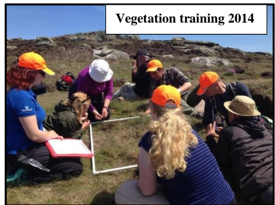
Vegetation training 2014