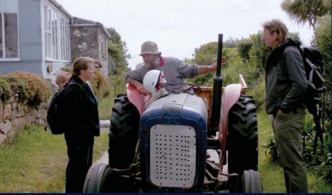
Project team working with the community