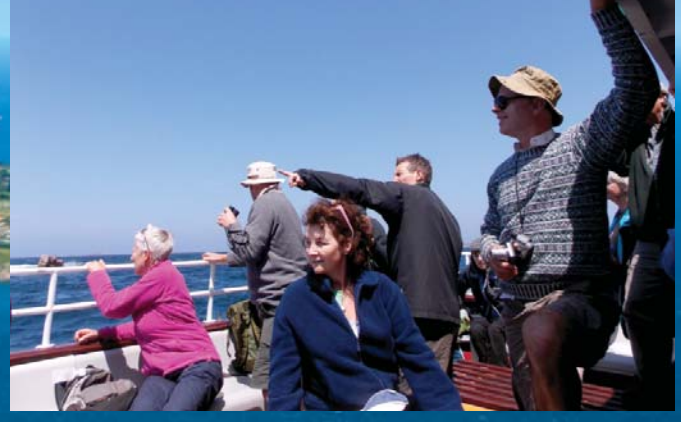
Wildlife boat tou