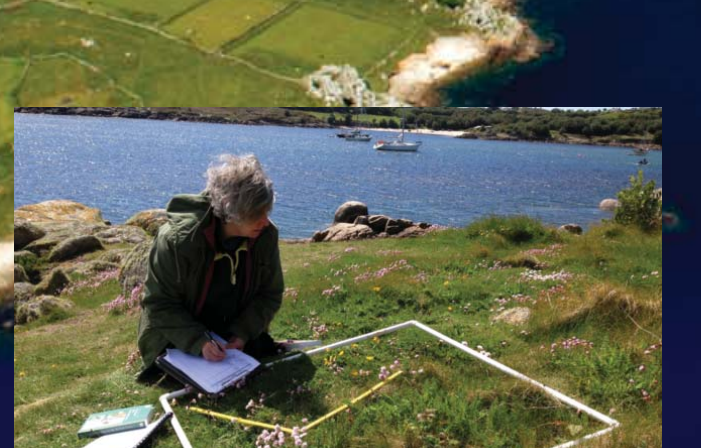
Vegetation surveys using a quadrat