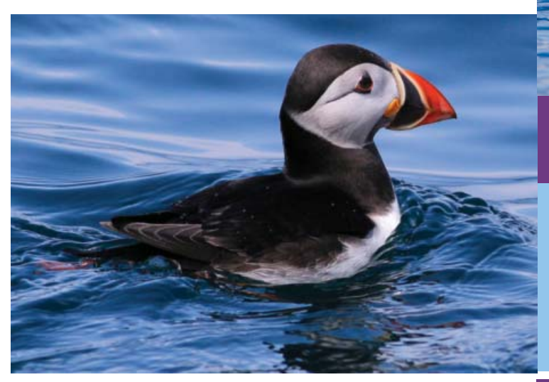
Puffin—a very popular summer visitor to the uninhabited islands

The Isles of Scilly are protected for their inspiring wildlife and landscape. This heritage is highly valued by those living and working here, and is of regional, national and international importance. This rich heritage generates a significant income from tourism.