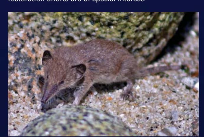
Scilly shrew

Volunteers are helping us to understand changes in a wide range of wildlife during the project. There are many opportunities to help with surveys of seabirds and other wildlife. The benefits to the Scilly shrew of restoration efforts are of special interest.