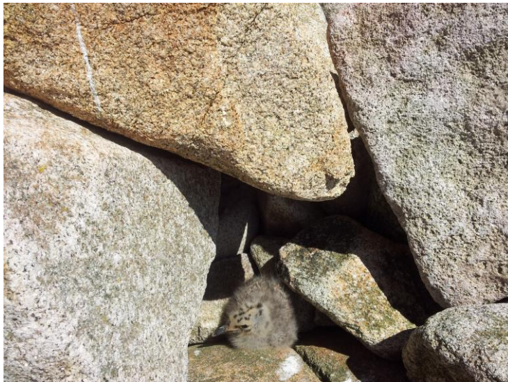
Herring gull chick hiding among the boulders on Samson

were due to fledge, all the large chicks (3+ weeks) visible were counted and productivity estimated as the number of large chicks divided by the number of nests. A separate note was made of small chicks and nests with apparently incubating adults and these nests re-checked later and totals adjusted accordingly.