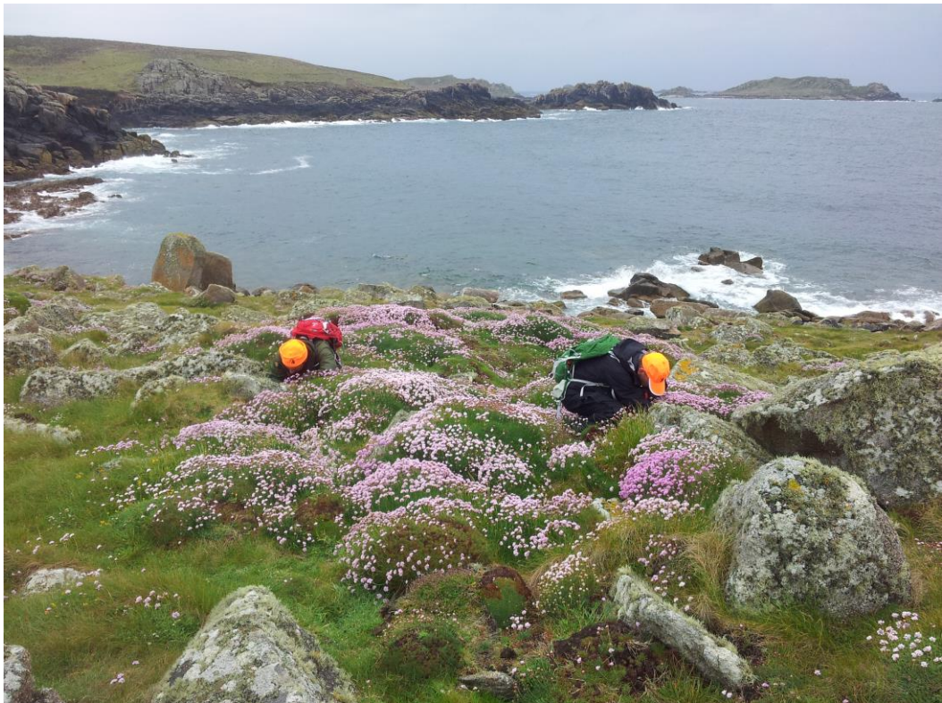
Playback survey for Manx shearwaters, Shipman Head Bryher 23.05.14