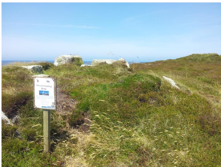
Signage north hill Samson