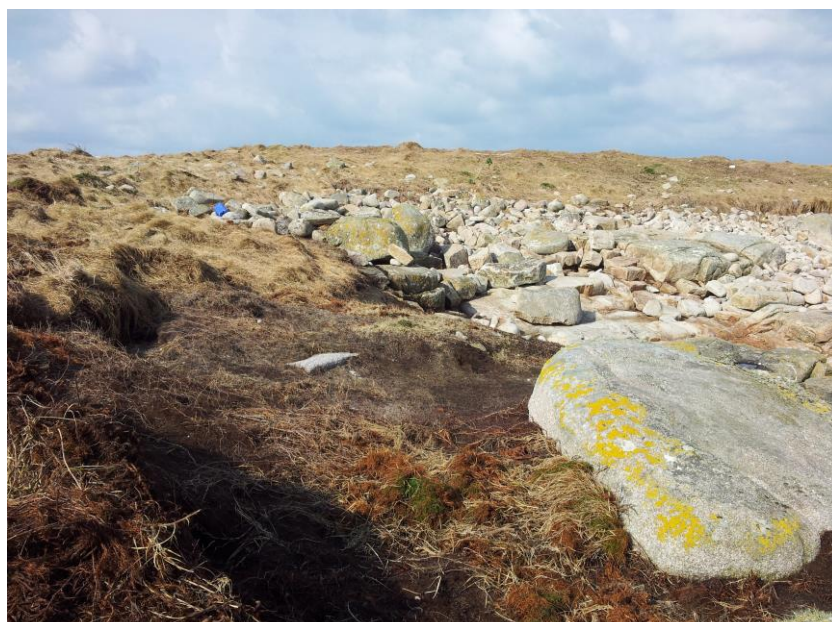
Annet storm petrel study beach taken in March 2014 – lighter pinkish rocks are all newly exposed and top layers of rocks with established lichen cover gone

Since 2010 the number of Apparently Occupied Sites at a study beach on Annet has been recorded annually using diurnal tape-playback. The study area is located at the South end of the island, in boulder beach between Smith's Carn and Minmow. The number of AOSs recorded here has been relatively stable, although the confidence intervals on playback response results are relatively large. However in 2014 this beach was found to have been totally destroyed in the February storms, so that most of the boulders had been removed and the reduction in depth exposed most of the previous breeding sites (see photo below). As a result only two responses were recorded. During the count at the end of May numerous storm petrels were heard singing beneath boulder beach elsewhere on the islands (prompted by footfall and rocks scraping together) and it does not appear that this low study count indicates an actual drop in the Annet population.