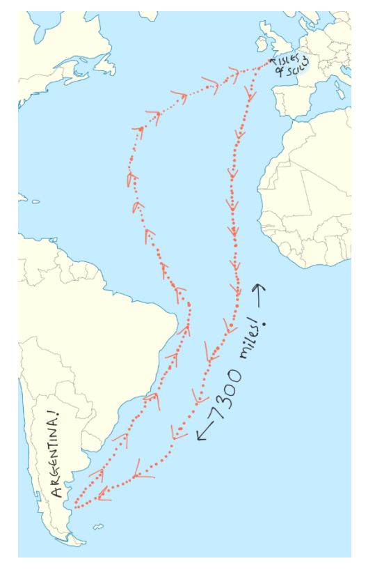
The migration route of the Manx Shearwater

- There is still very much to learn about the Manx Shearwaters migrating from Scilly so one day we may know more about their behaviour and migration routes.