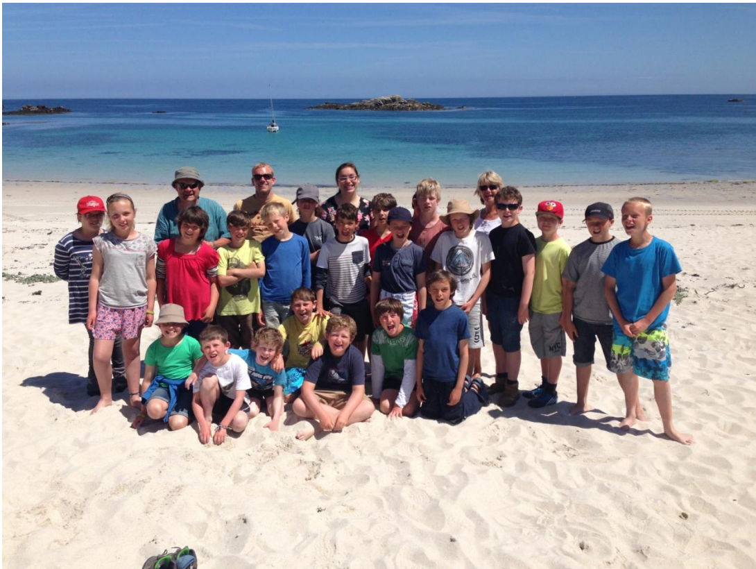
St Just School takes part in 'Coastal Creatures' activity on the beach.

This pack gives you information to organise a visit to the islands and what activities you can take part in when you are on the islands. You can find more information at www.ios-seabirds.org