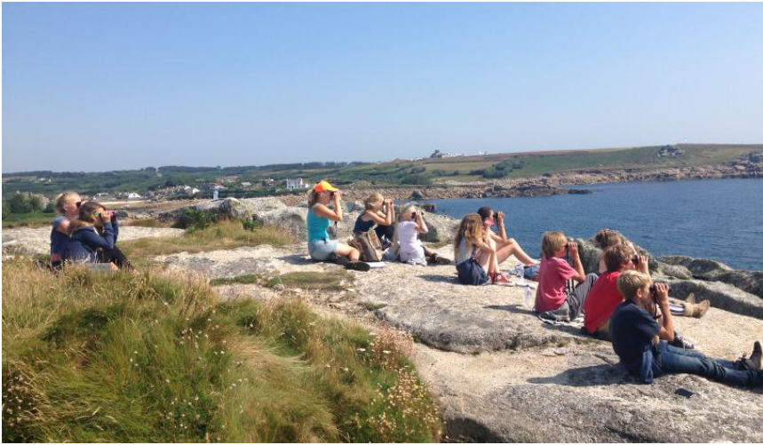
'Coastal Creatures' activity – we may even see whales and dolphins as we watch from the headland.