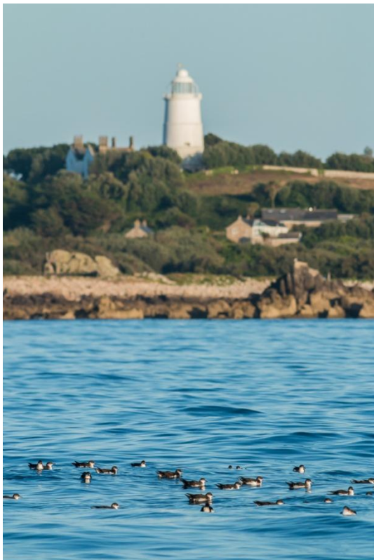
Manx shearwaters rafting. Ed Marshall

The Isles of Scilly Seabird Recovery Project aims to safeguard the seabirds of Scilly for future generations. Rats eat Manx shearwater and storm petrel eggs and chicks, in 2013 the rats were removed from St Agnes and Gugh.