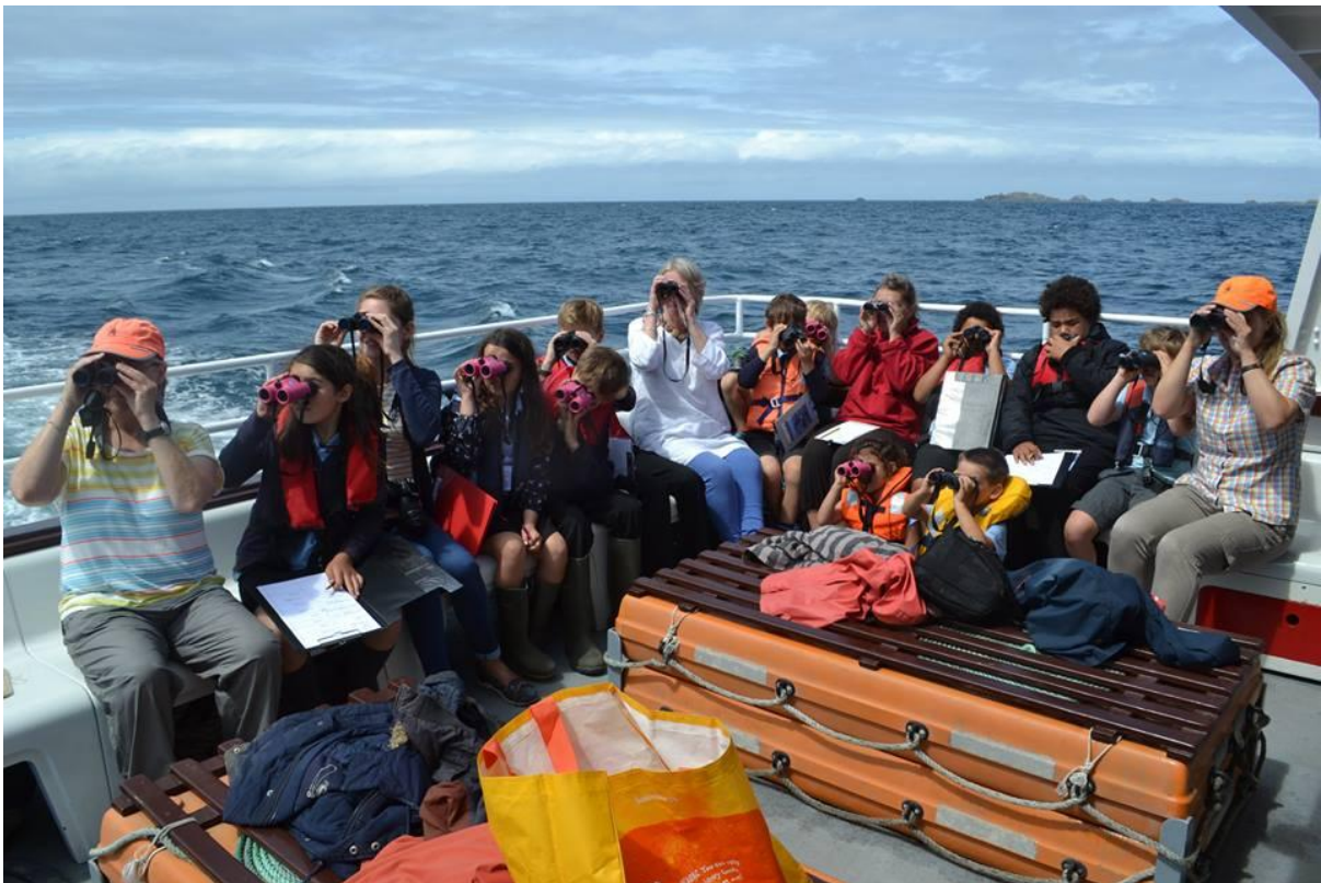
Schools can take a boat trip to see puffins and other seabirds.