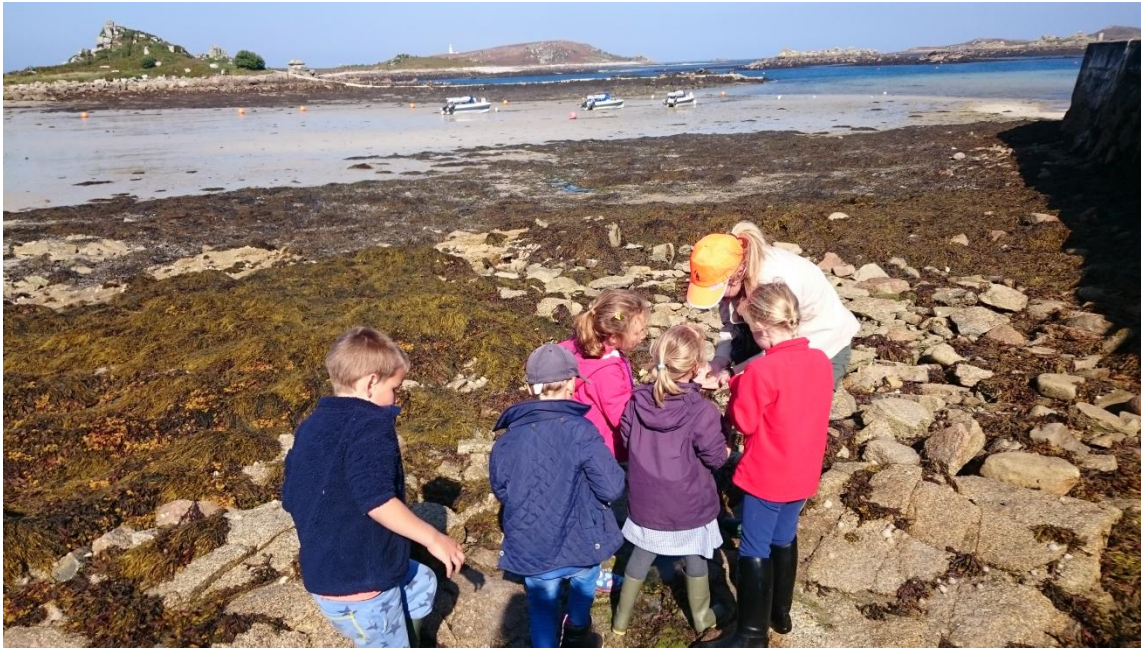
'Coastal Creatures' activity.