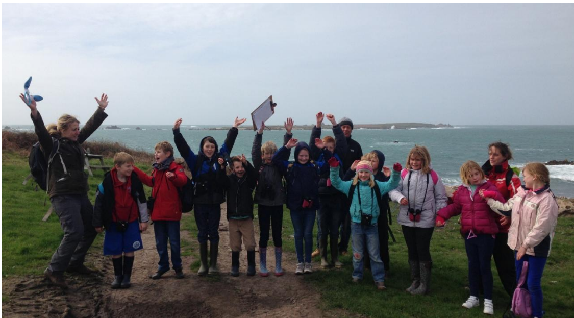
Council of the Isles of Scilly Holiday Club seabirds on land and sea activity.

Details are available on www.simplyscilly.co.uk Or Tourist Information Centre (TIC) 01720 424031