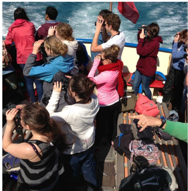
Exeter university Zoology BSC Field trip 'seabirds on land and sea activity'