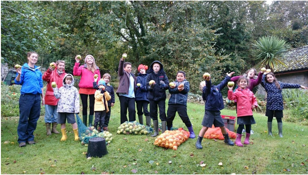
St Agnes School 'Apple Day' activity.

You can learn more about islands' seabirds and the work to conserve them from the following providers: