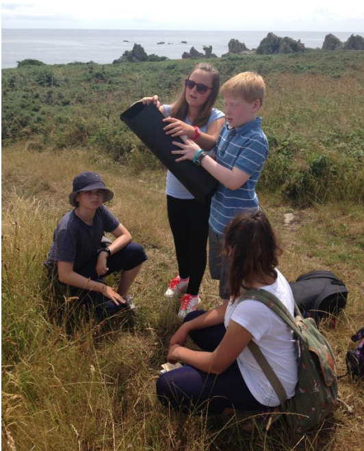
Bishop Stopford School 'Lets go on a shrew hunt activity'.