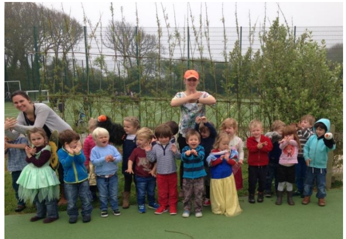
Nursery 'seabird song' activity 2015