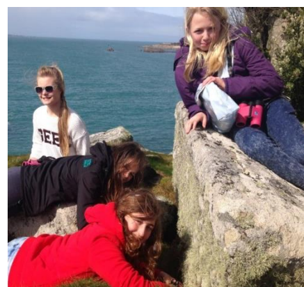
Sounds in music field trip to hear the Manx Shearwaters in burrow to understand the sounds out in the field.