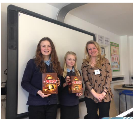
Sound in nature GCSE music assignment winners 2015