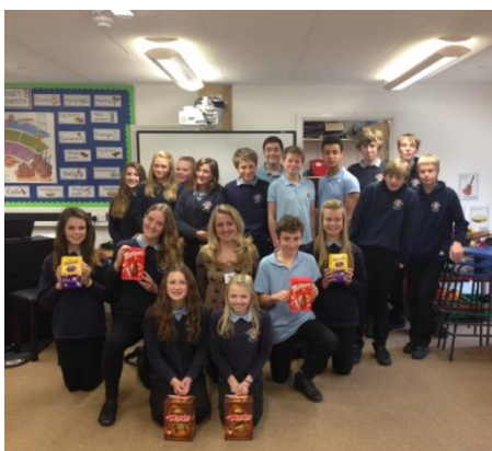
Sound in nature GCSE music assignment 2015

Year 9 2014 Winners https://vimeo.com/101074143