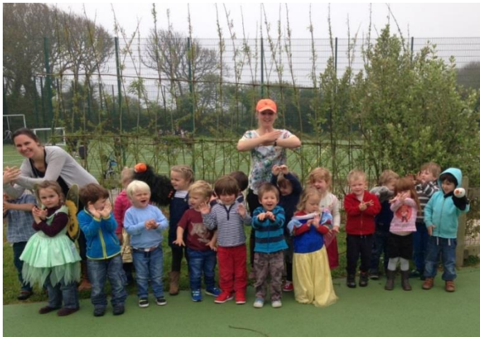
Nursery 'seabird song' activity 2015