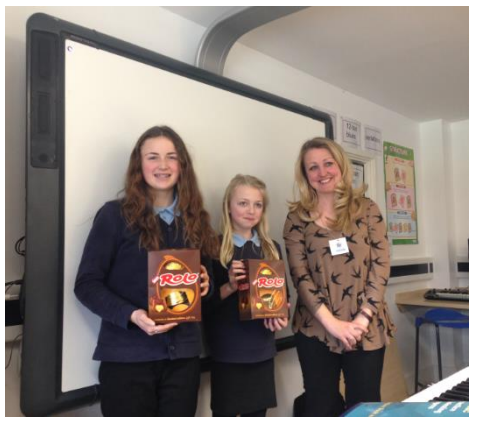
Sound in nature GCSE music assignment winners 2015