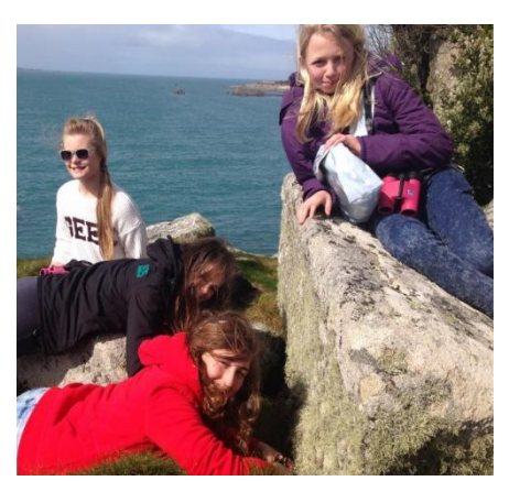
Sounds in music field trip to hear the Manx Shearwaters in burrow to understand the sounds out in the field.