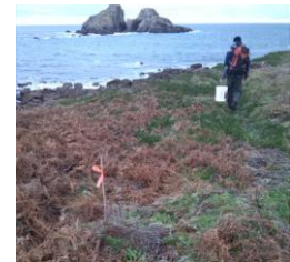
IOSWT Rangers St Helens