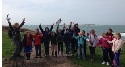
Council of the Isles of Scilly youth activity