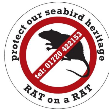
The 'rat on a rat' sticker!