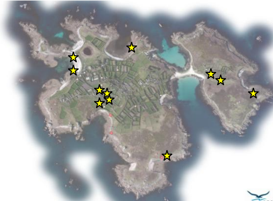
The 11 'rat on a rat' calls since March 2014, no rats recorded so far.

We will be offering half day training sessions on St Agnes after Easter. Pick a morning or afternoon. Details will follow shortly so keep an eye on the notice board. Now the visitor season has started, please do remain vigilant and in particular do remember to carry on with your bio-security protocols to keep rats away. But as ever, should you notice anything suspiciously ratty, just call that number!