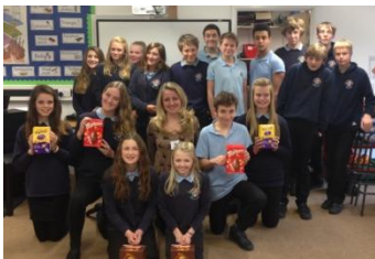
'Nature in Music Project' Year 9

Meanwhile early in March over at Penzance, Scillonian III Wildlife Guides were gathering for training sessions ahead of their first Friday trip of the year to the islands on Eclipse Day March 20 th ! They'll be on the boat each Friday throughout the season pointing out wildlife to passengers. Again you can check the website for weekly updates on what they spot.