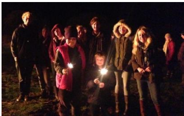
Sparklers at Community Bonfire Night

Happy New Year! The project is looking forward to the year ahead, the nights are getting lighter and the Manx shearwaters will start making their return journey soon. In the run up to Christmas we were busy with activities such as the St Agnes Bonfire night. Thanks to all the community members who are continuing to remove potential rat-harbours and what better way to do it than as part of a community bonfire, with fireworks and sparklers. We also visited the schools for creative Christmas crafts and composed a 'Manx Shearwater Christmas song' for Year 7's music class at Five Islands Secondary school, as we did not want to forget our Manxies at Christmas! No-one deserves to hear my dulcet tones singing on Radio Scilly, so the young people took to the task and did a fantastic job.