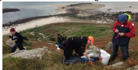
IOSWT Rangers and volunteer Rangers bait and place monitoring tools in stations on St Helen's